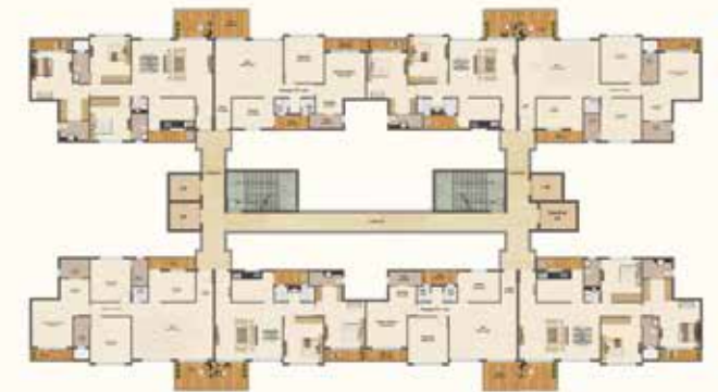
Typical floor plan (2 nd to 12 th floor)