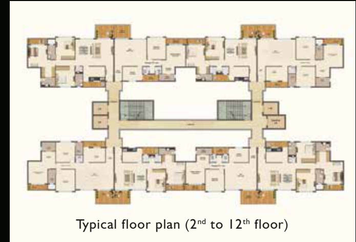
Typical floor plan (2 nd to 12 th floor)