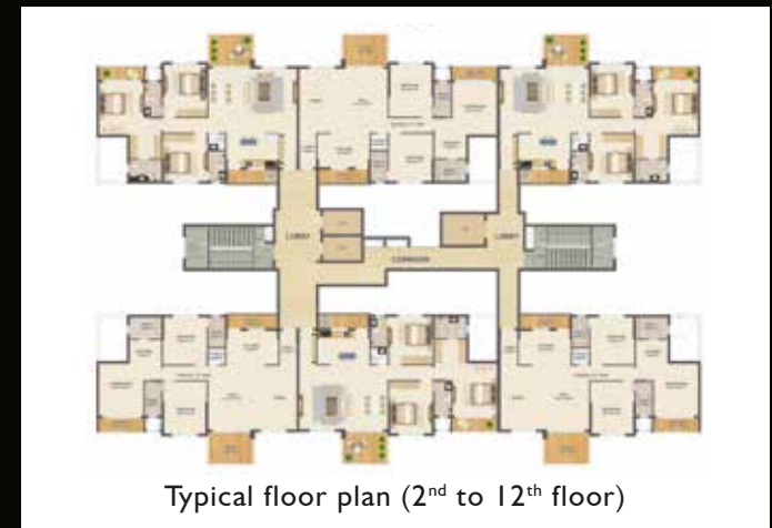
Typical floor plan (2 nd to 12 th floor)