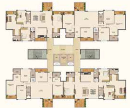
Typical floor plan (2 nd to 12 th floor)